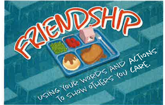
Friendship is a reflection of the character of God.

Jesus demonstrated friendship in the most generous way possible. He showed us the greatest love when He laid down His life for His friends. He went to the cross, not on principle or for a cause, but because of love and wanting to be with us forever.